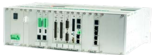
NTX-220, rear view