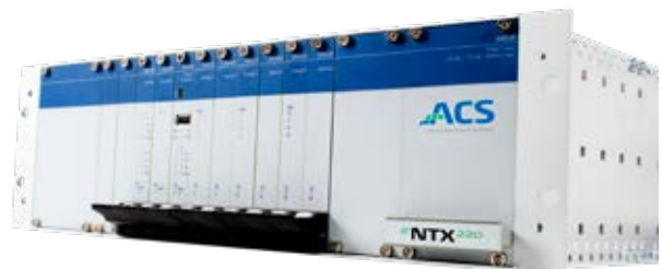
NTX-220, front view

The NTX-220 Substation Controller, the mid-size version of the ACS NTX series substation systems, provides complete substation management functionality. It also adds the ability to interface to a very large amount of data from integrated IEDs, and to a medium to large amount of data from hardwired local I/O devices in the substation. The NTX-220 is designed with multiple 32-bit CPUs operating within a client/server architecture. NTX-220 clients (such as the NTX gateway to IEDs) provide data that is received and processed at the server level in the NTX master gateway supplying the virtual databases to the master. Multiple user-defined subsets of this data can also be transmitted to one or more master stations in the master's native protocol. A medium amount of local analog and digital inputs can be configured in the six input module motherboard slots available. With the addition of an external expansion card file, these inputs are expandable to the maximum of 12 analog or digital input modules. Control relay outputs are also expandable to 256 relay outputs per control system node, utilizing externally mounted control relay modules with varying voltage and current contact ratings available.